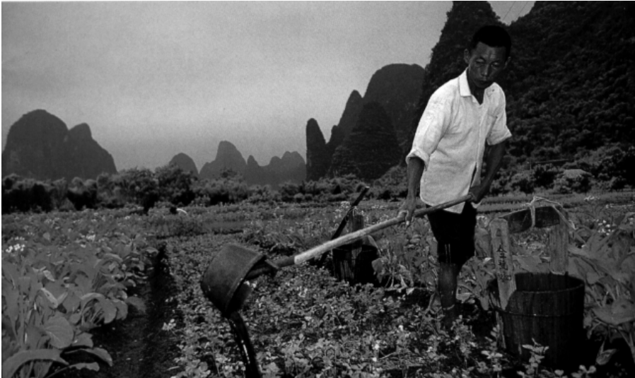
Tilling the Land in the New Territories

TRIP DEVIATIONS: Any request for tour deviation will be subject to availability at the time of booking. The maximum extension permitted is two weeks. A written request for deviation (your personalized travel itinerary and your telephone number), along with the surcharge fee of $100, should be submitted at the time of initial payment, but will be accepted up to 90 days prior to departure. After processing, the request, any additional deviation expenses (car rental, train, hotel, etc.) must be paid, in full, to the Retail Department of Durgan Travel Service at the time of reservation.