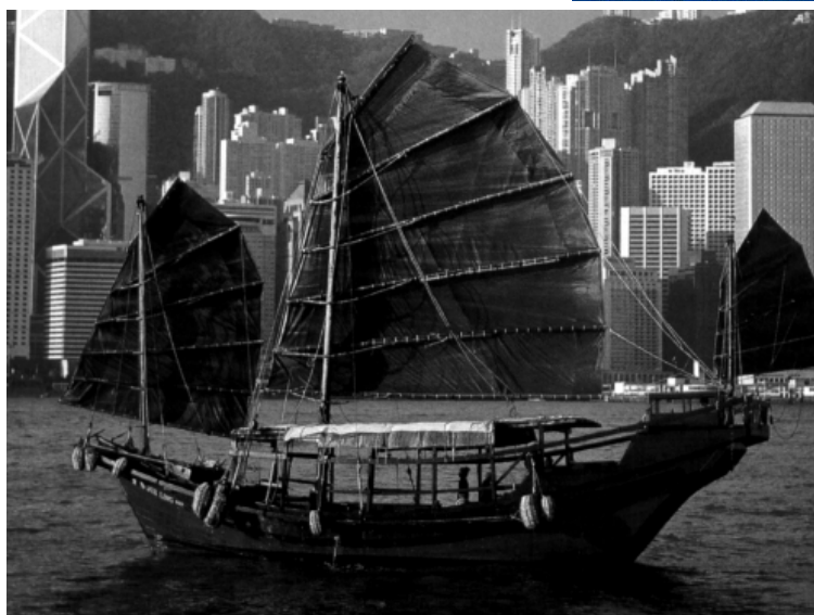
The Old and New of Hong Kong