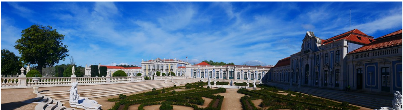
Palace of Queluz

PLEASE ENSURE THAT ALL NAMES ARE FILLED IN AS THEY APPEAR ON PASSPORTS. The Transportation Security Administration (TSA) requires the following information: You are responsible for filling out this form correctly and completely, and failure to do so will result in the denial of boarding at the airport and/or financial penalties (upwards of $125). You are responsible for any expenses, inconveniences, or loss of trip stemming from providing incomplete or incorrect information. Additionally, airlines are refusing to do "name changes" if information is not provided properly in the first place, resulting in the passenger losing their seat. Any missing or outdated information MUST be provided to Durgan Travel no later than 75 days prior to departure. Plan to renew your passport in time to submit all pertinent information by 75 days prior to departure. Your passport must be good for a minimum of six (6) months after your return date.