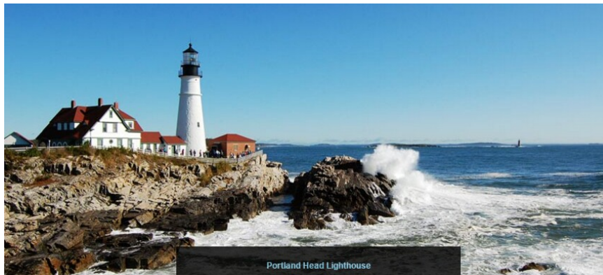
Portland Head Lighthouse

*All rates are per person, twin occupancy, and INCLUDE $173.00 in port & government taxes, fees and fuel surcharges ( subject to change ). Singles pay 200% of the rate for that category. Call Durgan Travel for third & fourth person rates.