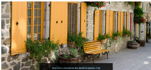
Step into a storybook like world in Quebec City

*The above rate is for a Category IE inside cabin and payment by cash or check. See rate chart for additional rates and categories.