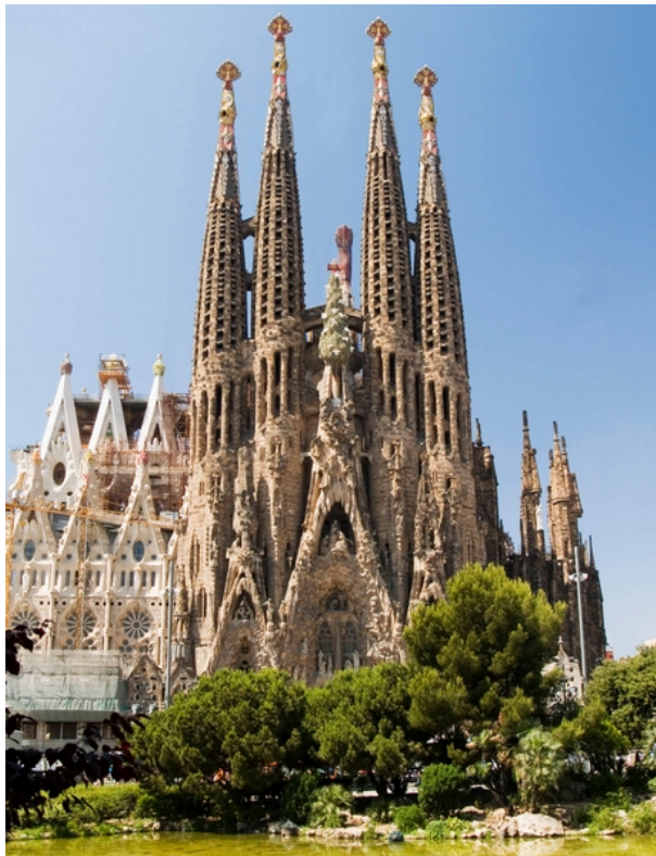
La Sagrada Familia Basilica

PLEASE ENSURE THAT ALL NAMES ARE FILLED IN AS THEY APPEAR ON PASSPORTS. The Transportation Security Administration (TSA) requires the following information: You are responsible for filling out this form correctly and completely, and failure to do so will result in the denial of boarding at the airport and/or financial penalties (upwards of $125). You are responsible for any expenses, inconveniences, or loss of trip stemming from providing incomplete or incorrect information. Additionally, airlines are refusing to do "name changes" if information is not provided properly in the first place, resulting in the passenger losing their seat. Any missing or outdated information MUST be provided to Durgan Travel no later than 75 days prior to departure. Plan to renew your passport in time to submit all pertinent information by 75 days prior to departure. Your passport must be good for a minimum of six (6) months after your return date.