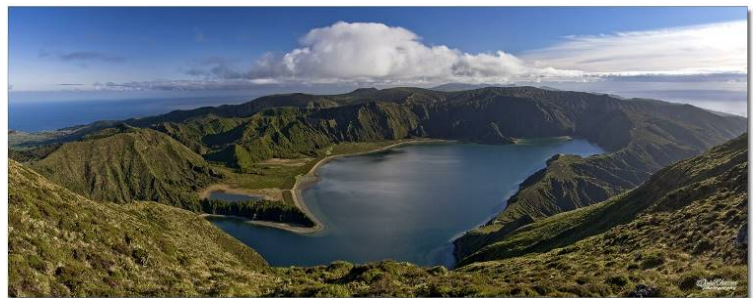
Lagoa do Fogo - São Miguel - Açores