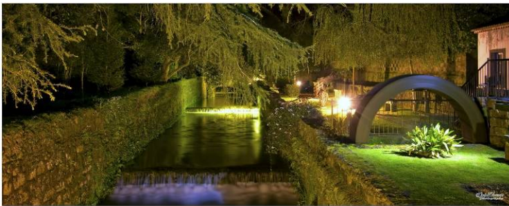
Furnas - São Miguel - Açores

Hold your place on the tour with just a $25 per person deposit (with only $10 of that nonrefundable in the event of cancellation) instead of the normal $400, and will bill you for the remainder of your full deposit six months prior to departure. Upon receipt of the remainder of the full deposit, standard cancellation penalties will apply and we will book the nonrefundable insurance for you at that time (if selected). If initial deposit is made after the date above, simply pay the full per person deposit up front.